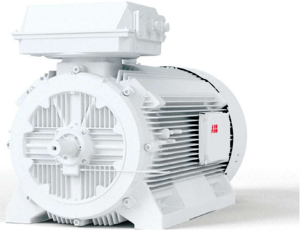
ABB Ability™ Smart Sensor is a condition monitoring solution that makes predictive maintenance possible for almost all low voltage motors. By monitoring and analyzing data on motor operating parameters, it enables motor users to optimize their maintenance. The solution helps to reduce downtime by as much as 70 percent, extend motor lifetimes by up to 30 percent and reduce energy consumption by up to 10%.